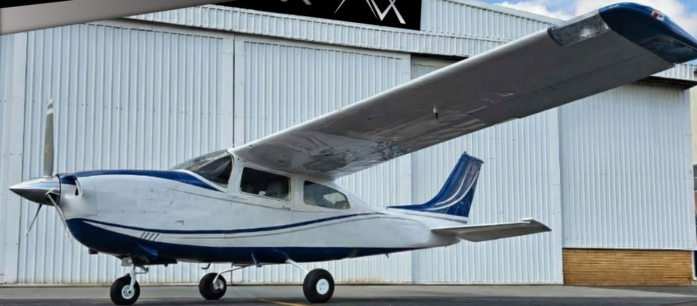
1971 Cessna 210 Turbo