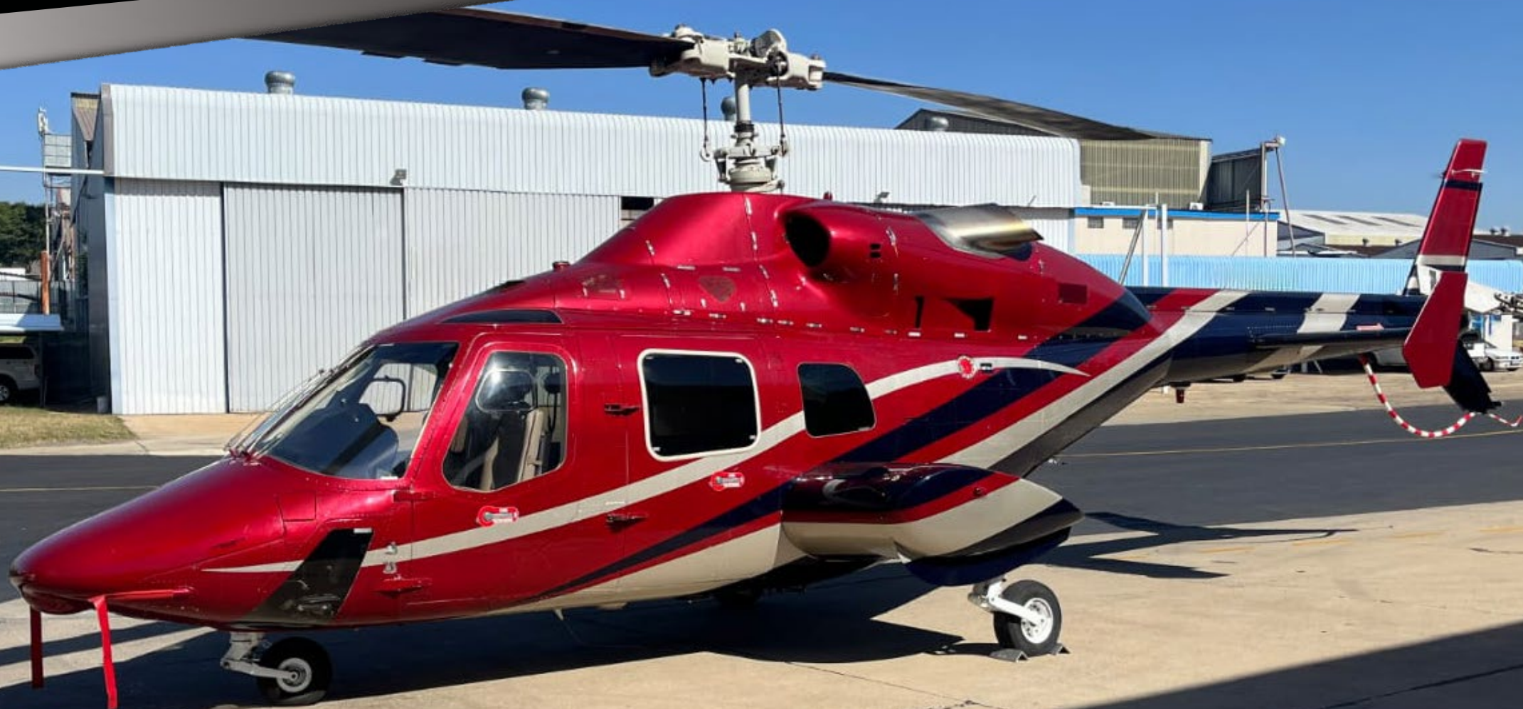
1992 Bell 230