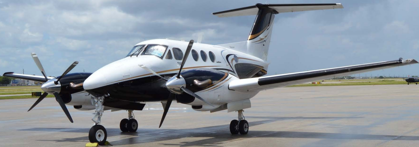
1980 King Air F90