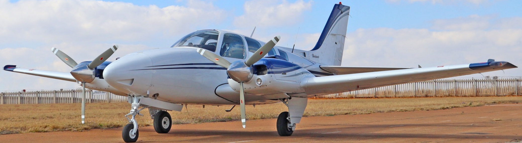
1983 Beechcraft Baron 58