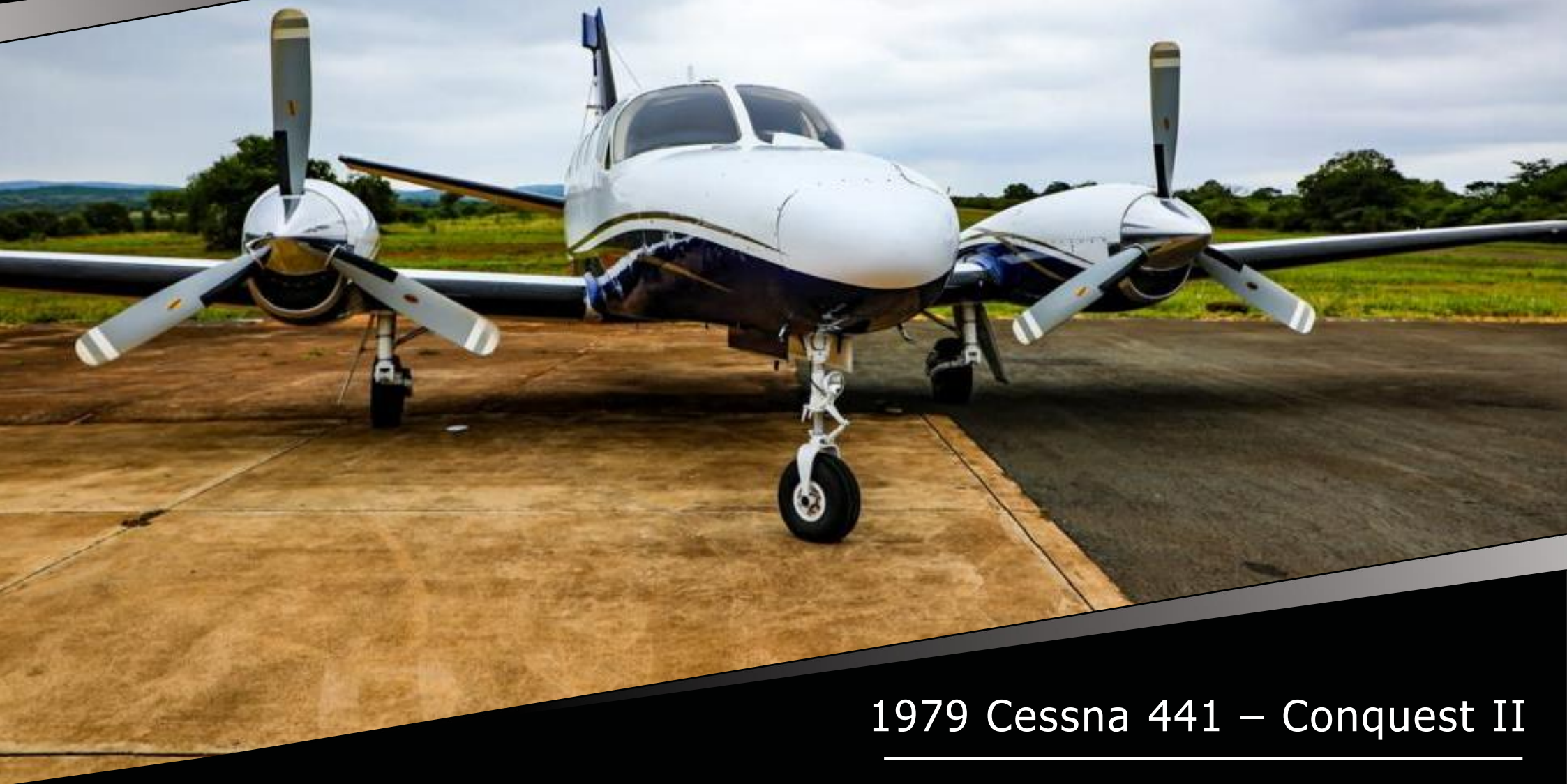
1979 Cessna 441 – Conquest II